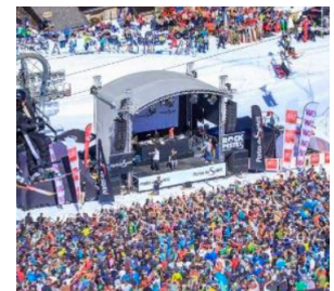
Rock the Piste Festival

For more events & activities please click here