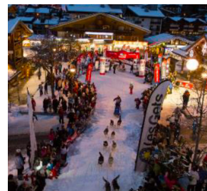
La Grande Odyssée Savoie