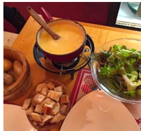
La Potiniere (Bruyeres)

Both Les Bruyeres and Reberty 2000 have a selection of restaurants, just footsteps from the chalet you are staying in. Les Menuires is easily accessible by the free resort shuttle service where there is plenty of dining options to choose from, covering everything from a quick pizza to fine dining.