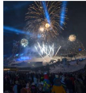
New Year's Eve