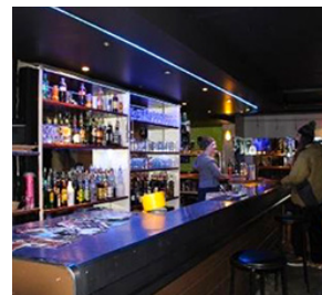
Bar Pub Le Mousse (Les Menuires)