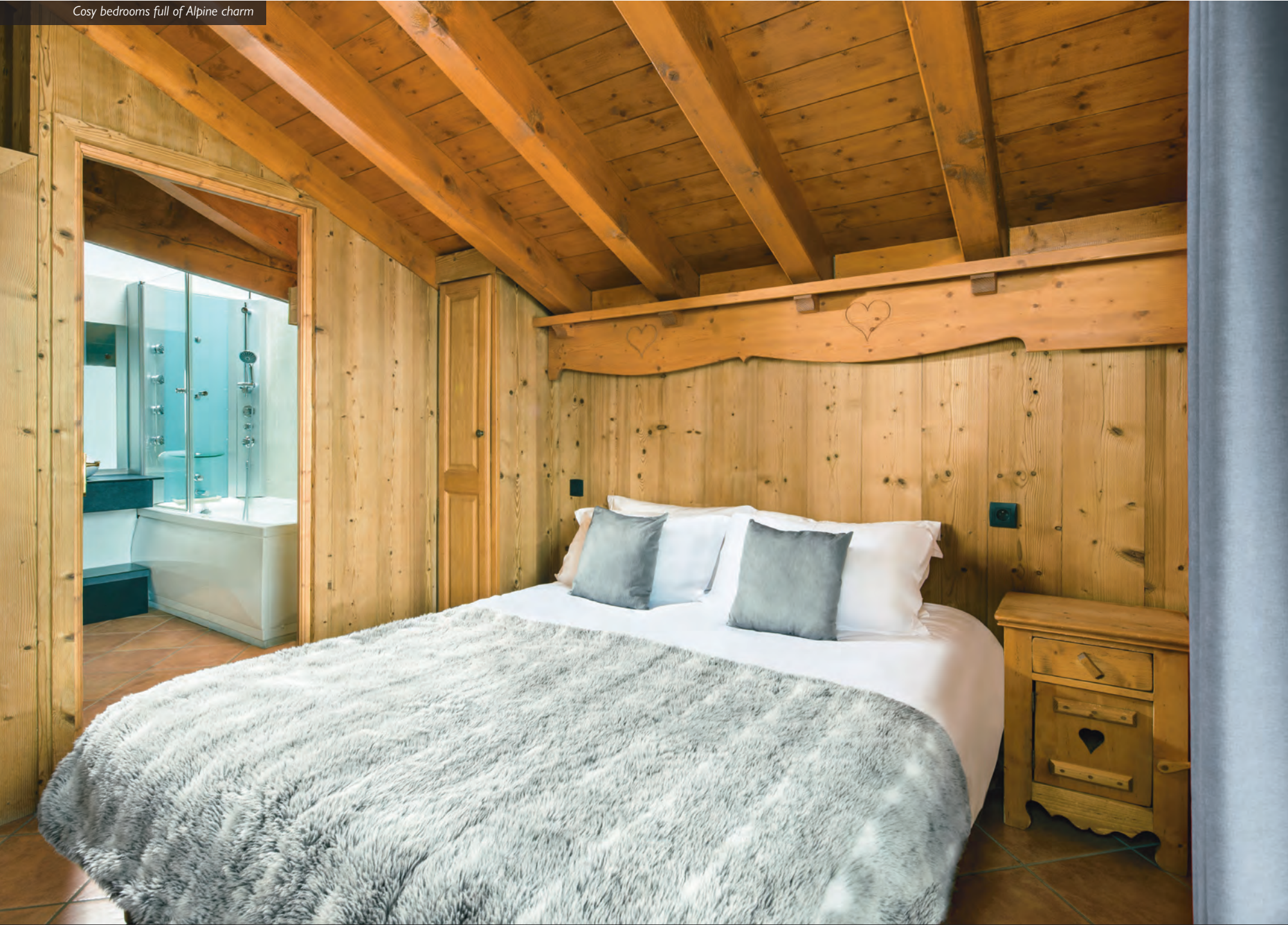
Cosy bedrooms full of Alpine charm