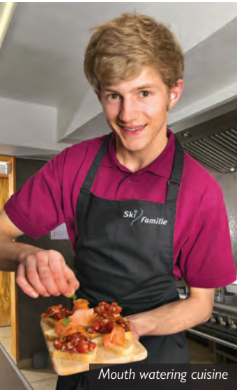
Mouth watering cuisine

We will always do our very best to cater for special diets for both adults and children. As we are catering at high altitude ski locations during winter, local availability of specialist foods can be limited and may not be available at all. Therefore it is essential you inform us of any special dietary requirements at the time of booking your holiday to help us to help you. There is no supplement for vegetarian meals. For special diets such as vegan, gluten or dairy-free, there is an extra charge of £35 per person when pre-booked. The in-resort charge is £59 per person. If you have any queries prior to booking please call 01252 365495 to discuss your needs.