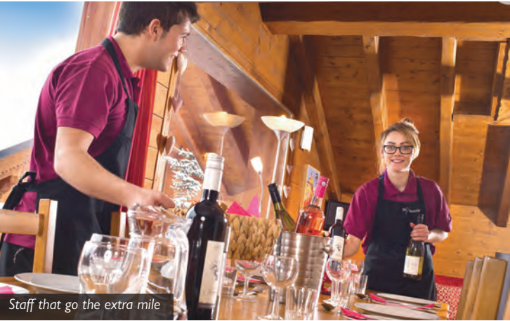
Staff that go the extra mile

Our service includes breakfast and afternoon tea every day. Dinner service can be high tea for children, or later as a family or adult-only if you take advantage of Monty's Pyjama Club (see page 10). Dinners are for six nights allowing you one evening to eat out at a restaurant in resort.