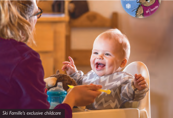
Ski Famille's exclusive childcare

Our À La Carte Childcare options Our exclusive À La Carte Childcare options allow you to tailor the most appropriate level of support for your family. Some parents are looking for all day care to maximise time on the slopes, whilst others are seeking options that allow afternoons spent en-famille. All children receive a Monty the Marmot badge and ski certificate with Ski Famille Childcare.