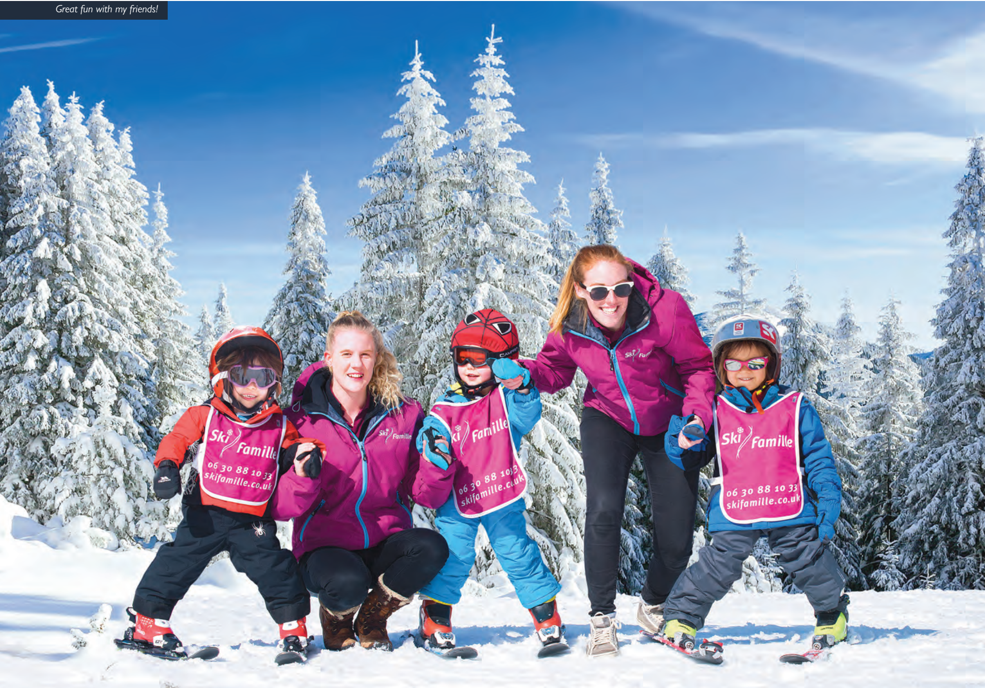
Great fun with my friends!