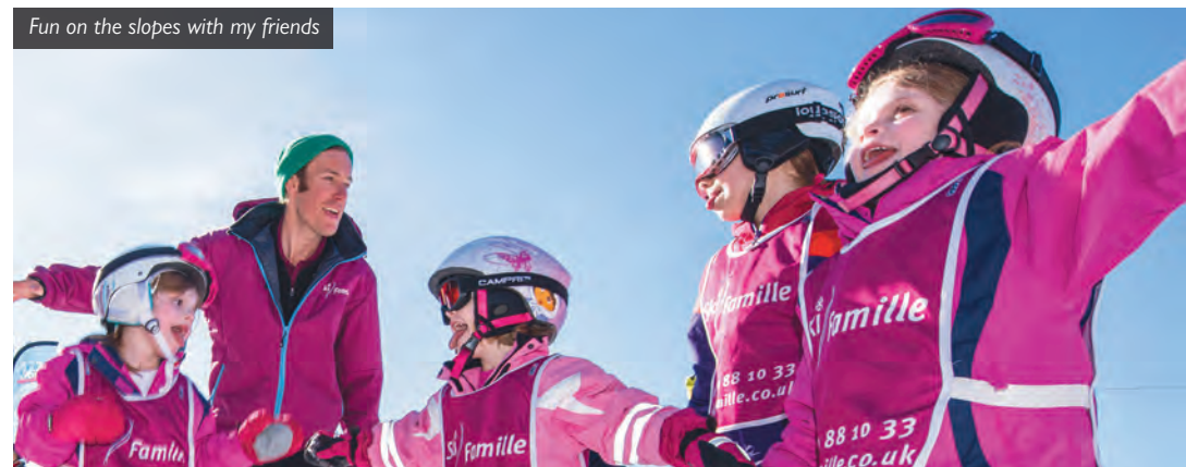
Fun on the slopes with my friends