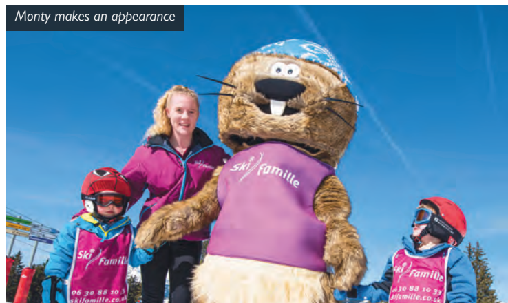
Monty makes an appearance