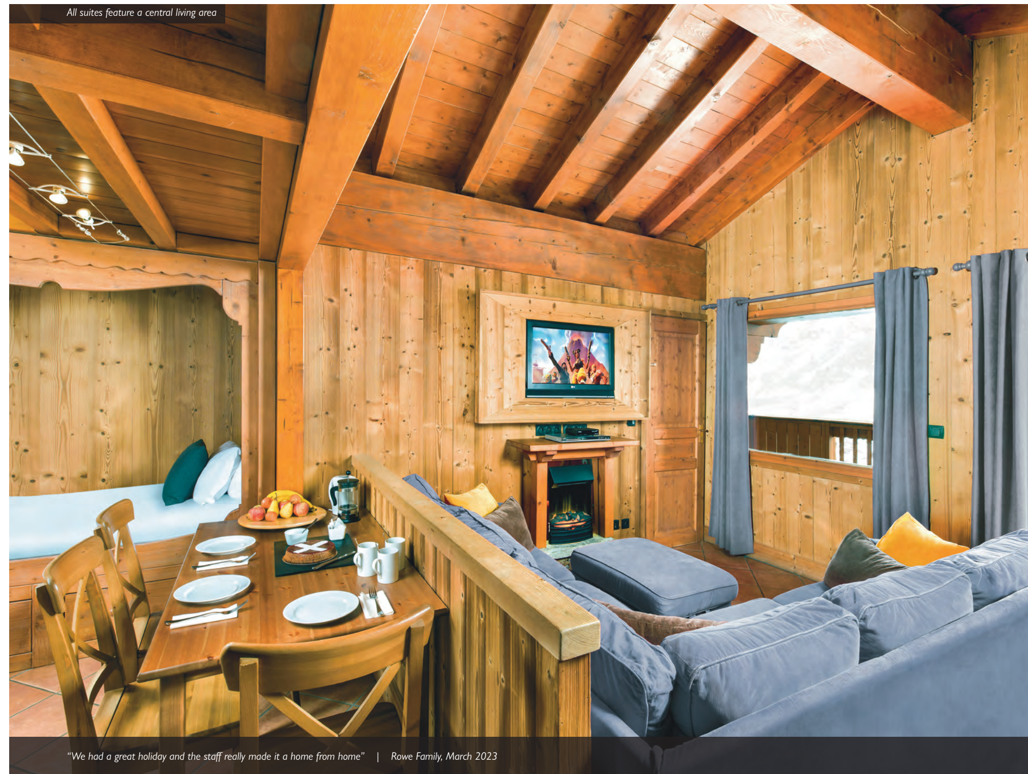
All suites feature a central living area