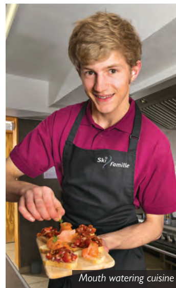
Mouth watering cuisine

We will always do our very best to cater for special diets for both adults and children. As we are catering at high altitude ski locations during winter, local availability of specialist foods can be limited and may not be available at all. Therefore it is essential you inform us of any special dietary requirements at the time of booking your holiday to help us to help you. There is no supplement for vegetarian meals. For special diets such as vegan, gluten or dairy-free, there is an extra charge of £35 per person when pre-booked. The in-resort charge is £59 per person. If you have any queries prior to booking please call 01252 365495 to discuss your needs.