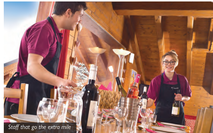
Staff that go the extra mile

Our service includes breakfast and afternoon tea every day. Dinner service can be high tea for children, or later as a family or adult-only if you take advantage of Monty's Pyjama Club (see page 10). Dinners are for six nights allowing you one evening to eat out at a restaurant in resort.