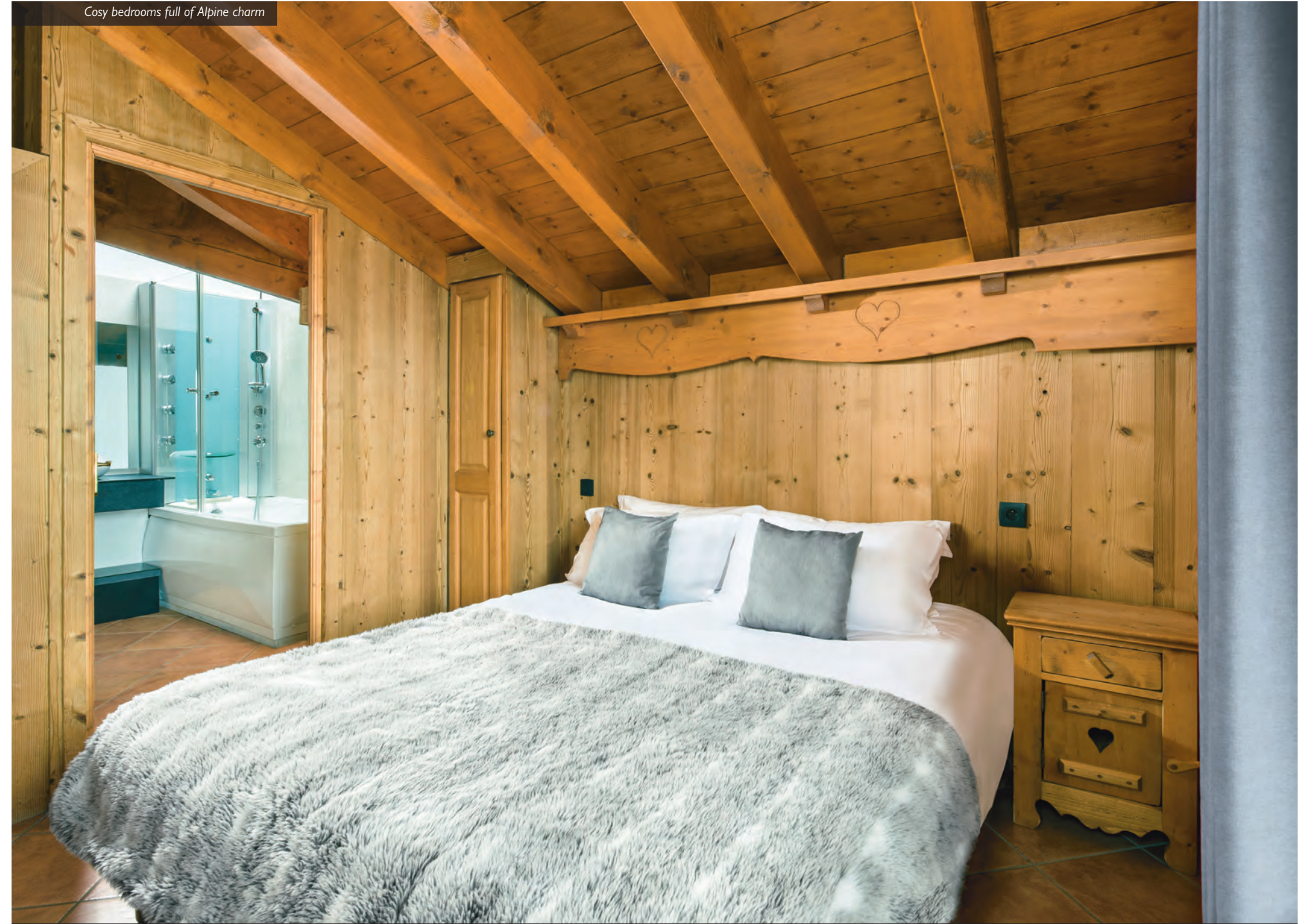
Cosy bedrooms full of Alpine charm