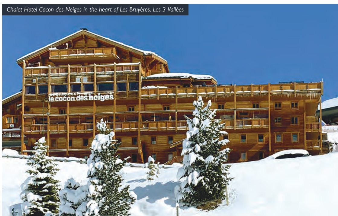
Chalet Hotel Cocon des Neiges in the heart of Les Bruyères, Les 3 Vallées

Chalet Hotel Cocon des Neiges is nestled right at the foot of the blue runs alongside the Bruyères gondola lift. There's a nursery slope and covered 'Magic Carpet' lift literally next door and access to the first gondola of the day and the whole of Les 3 Vallées ski area is just outside your Chalet Hotel. Take the stunning gondola to the mid-station, clip in and ski the cruisy blue runs straight to your door. For even more fun, stay on the gondola to the top where you have endless choices - ski over to Val Thorens or even down into the Meribel valley or head home via the myriad of red runs, the spicy black run or carve the mellow blue runs back into the valley. Many of these runs link perfectly to the blue runs heading home - so at the end of an amazing days skiing, just cruise down, un-clip your skis and welcome home!