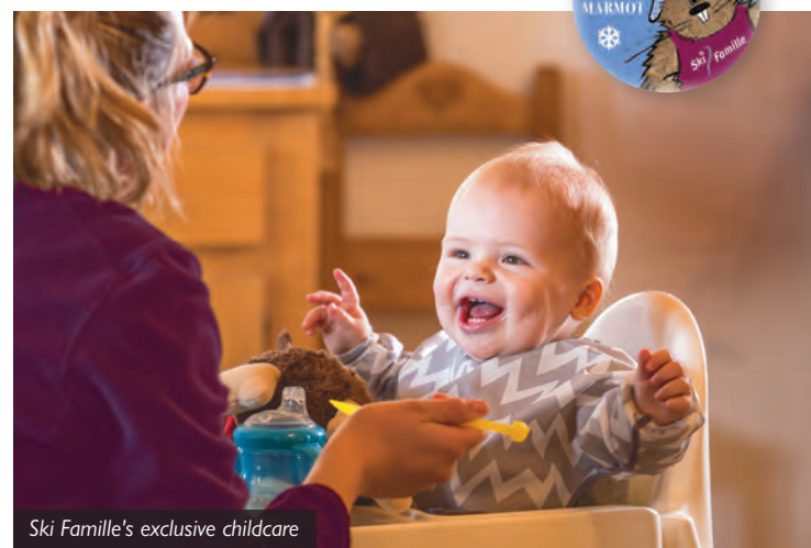
Ski Famille's exclusive childcare