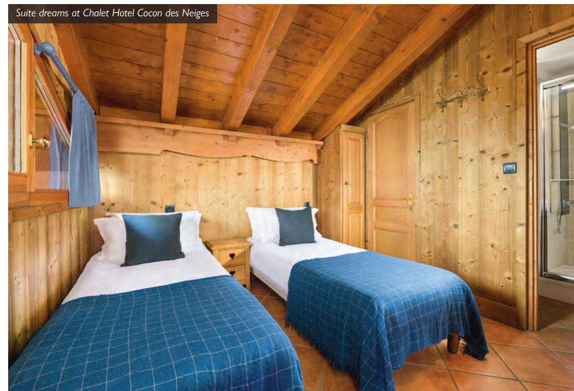
Suite dreams at Chalet Hotel Cocon des Neiges