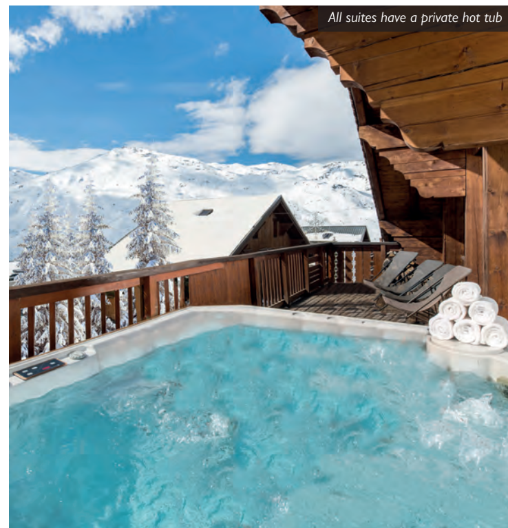
All suites have a private hot tub