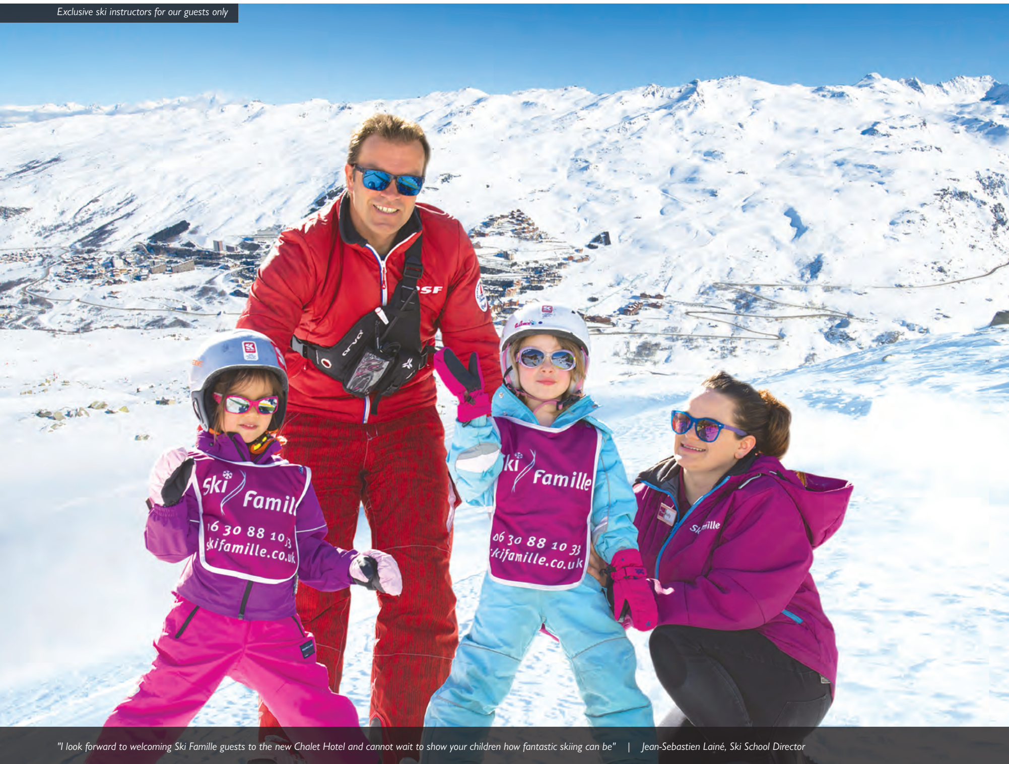
Exclusive ski instructors for our guests only

Please note, all the above childcare needs to be pre-booked in advance and is not available as an option in resort.