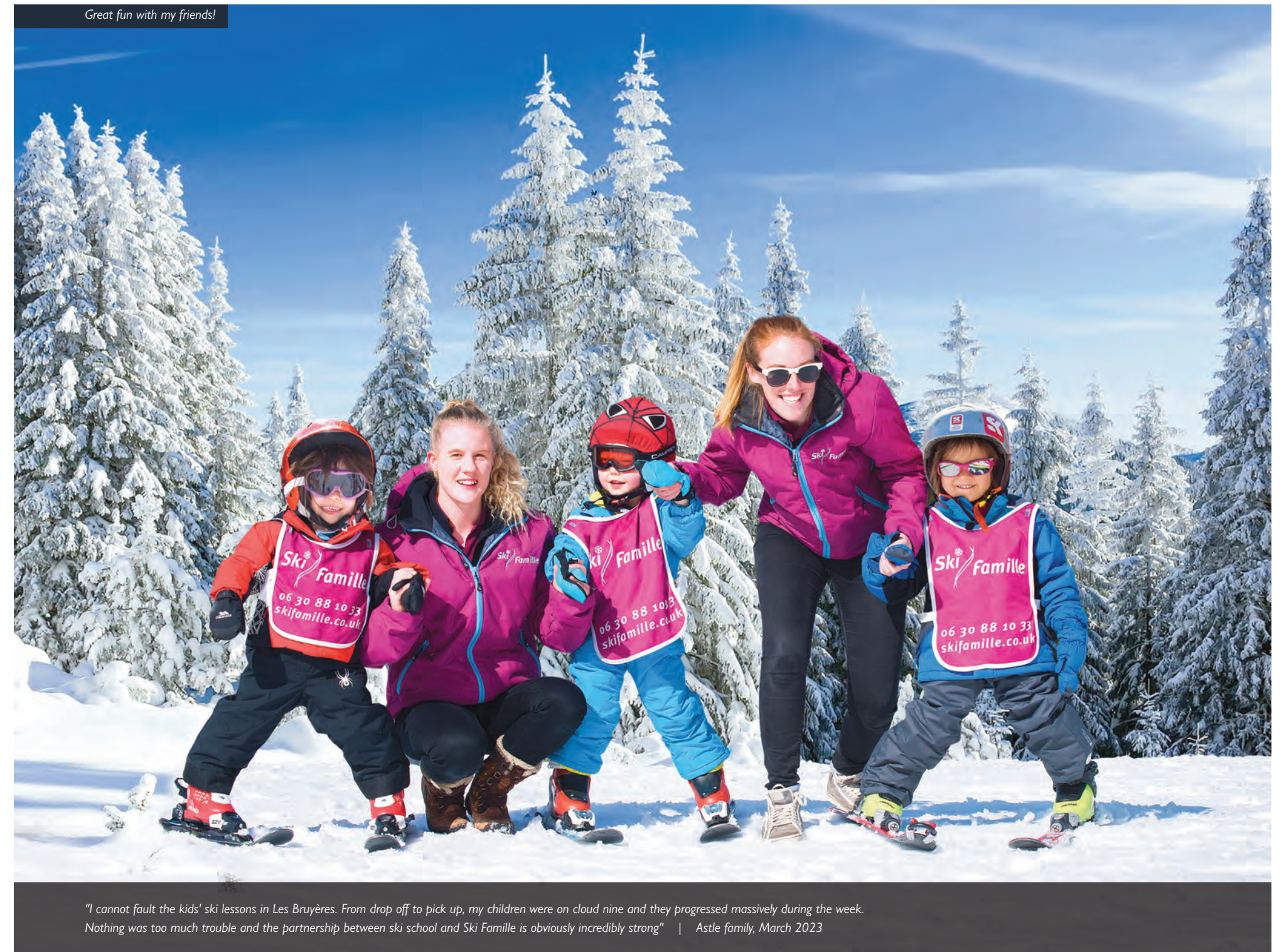
Great fun with my friends!